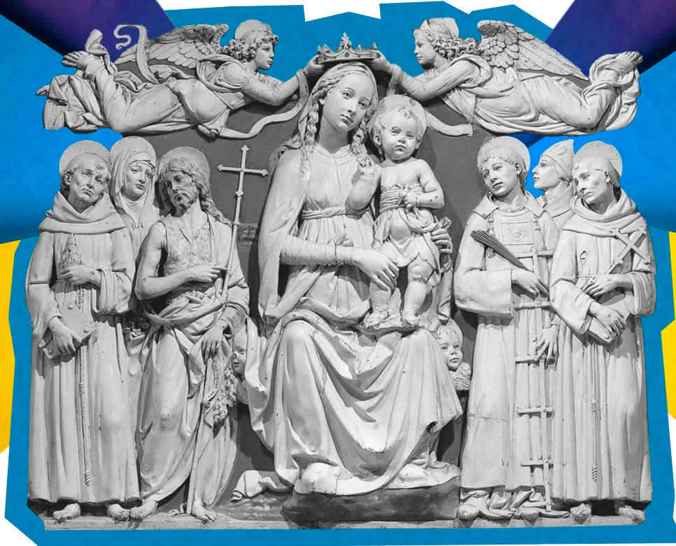
"Madonna and Child with Saints" by Andrea Della Robbia

Lets pray to our Blessed Mother the faithful woman who desires from us to live this virtue of fidelity in our consecrated life. (all together)